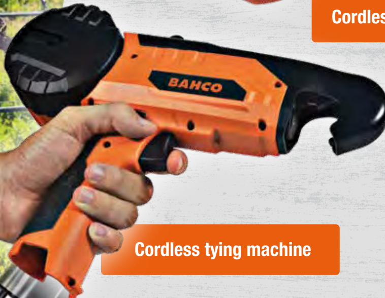
Cordless tying machine